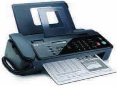
Fig. 2.12. Fax Machine

Fax Machine: A fax machine is the telephonic transmission of scanned printed material (text or images), usually to a telephone number associated with a printer or other output device. The original document is scanned with a fax machine, which treats the contents (text or images) as a single fixed graphic image, converting it into a bitmap. In this digital form, the information is transmitted as electrical signals through the telephone system. The receiving fax machine reconverts the coded image and prints a paper copy of the document.