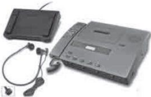
Fig. 2.3. Dictation Machine

3. Dictation Machines: Dictation Machines are generally used by the executives who need to draft letters, memos, and reports are best off dictating the copy and recording it, as speaking is much faster than writing and can be done while performing other tasks. This type of equipment chosen depends on the preference of the dictators, number of users, frequency of use, and budget. Some dictation equipment use cassette tapes and most of the modern versions are digitally recorded and also this phone system is used for recording. Once the audio is recorded, this file is processed to another employee, who transcribes the audio into a written document, saves and emails or prints it.