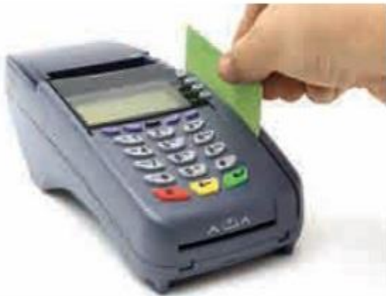
Fig. 2.7. Swipe Machine

Swipe Machine: A swipe machine is a payment terminal provided by the bank on which the merchant can swipe a dip card to receive payments. Since the card can be a debit or a credit card the machine is also known as a credit card swipe machine or a debit card swipe machine.