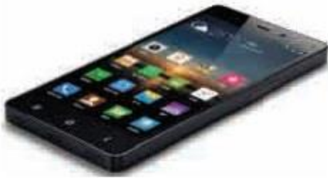
Fig. 2.2. Mobile Phone

3. Dictation Machines: Dictation Machines are generally used by the executives who need to draft letters, memos, and reports are best off dictating the copy and recording it, as speaking is much faster than writing and can be done while performing other tasks. This type of equipment chosen depends on the preference of the dictators, number of users, frequency of use, and budget. Some dictation equipment use cassette tapes and most of the modern versions are digitally recorded and also this phone system is used for recording. Once the audio is recorded, this file is processed to another employee, who transcribes the audio into a written document, saves and emails or prints it.