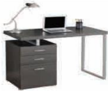
Fig. 2.14. Desk

Executive Desk: These are designed to suit individual tastes and quite often they are designed as a show piece of an organisation. Their purpose is also to impress visitors. Sharp edges and corners are eliminated. Table top is covered with a sheet of glass.