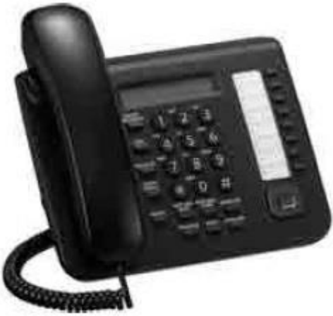
Fig. 2.1. Telephone

The following are some of the internal and external services available to telephone users.