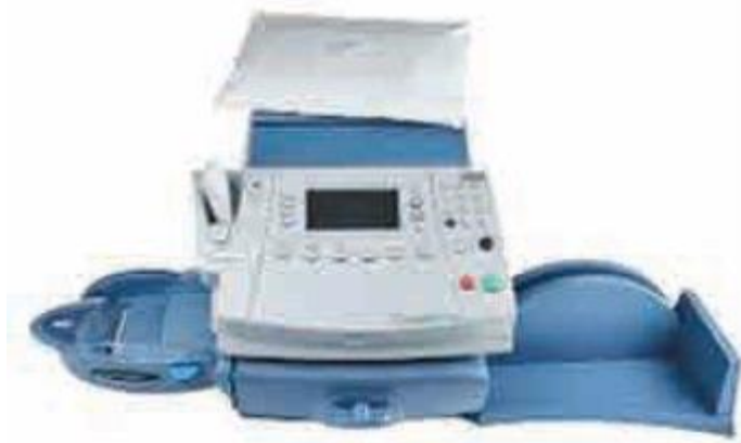
Fig. 2.6. Franking Machine

ate of posting in bright red ink. It has a meter which records the amount and balance on hand.