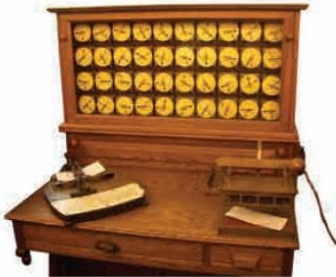
Fig. 2.5. Tabulating Machine

5. Tabulating Machines The tabulating machine is an electro mechanical machine designed to assist in summarizing information stored on cards. It was invented by Herman Hollerith.