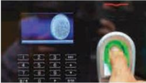
Fig. 2.10 Bio-Metric System

Bio-Metric: A Biometric device is a security identification and authentication device. Such devices use automated methods of verifying or recognizing the identity of a living person based on a physiological or behavioural characteristics. These characteristics include fingerprints, facial images and voice recognition.