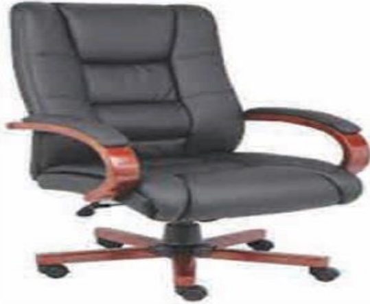
Fig. 2.15. Chair

adjustable back rest to enable the user to perform their work efficiently.