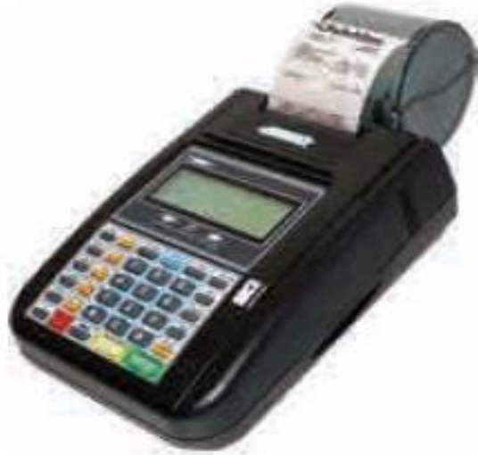
Fig. 2.4. Billing Machine

Billing Machine: Billing machines are used to prepare invoices, bills of lading, cash memo, etc. The machine makes all calculations of discounts, commission, addition, subtraction, total, etc. Papers and carbons are fed into the machine and set automatically.