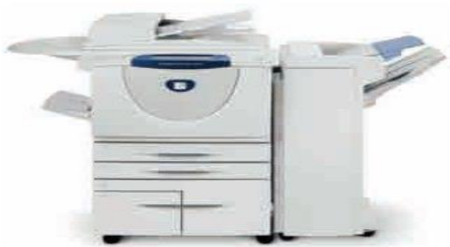
Fig. 2.13. Xerox Machine

Photostat Machine: It is popularly known as “Xerox” machine taking its name from the company manufacturing this machine. Photocopying machines help in getting exact copies of the original at a greater speed. The term xerography means dry pictures. Copies of diagrams, illustrations, drawings etc. can also be obtained. It eliminates the need for checking.