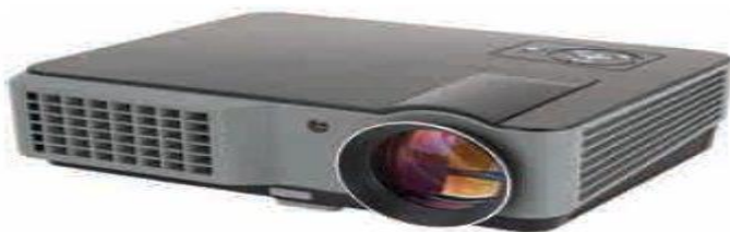
Fig. 2.9. LED Projector

5. LED (Light Emitting Diode) Projectors: Instead of a traditional halogen lamp, they use light-emitting diodes, which are more environment friendly and long lasting. LED projectors use either DLP technology, replacing the colour wheel and white-light lamp with red, blue, green LEDs or LCOS technology which is found in projectors.