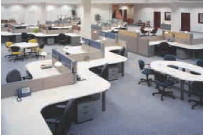
Fig. 2.16. Modular Furniture