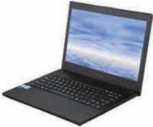
Fig. 2.8. Laptop

Pen Drive: A pen drive is a small storage device shaped like a pen with built-in data storage that connects to a computer by a USB Port. (Universal Serial Bus- It is the most popular connection used to connect a computer to devices).