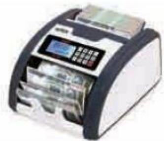
Fig. 2.11. Currency Counting Machine

Currency Note Sorting and Counting Machine: A currency note sorting machine is a compact and portable desktop solution for multi-currency counting and sorting challenges. It can denominate and authenticate different currencies at a processing speed of 1000 notes per minute. A currency note counting machine is a machine that counts money either stacks of bank notes or loose collections of coins. Currency counters are commonly used in vending machines to determine the amount of money which has been deposited by customers.