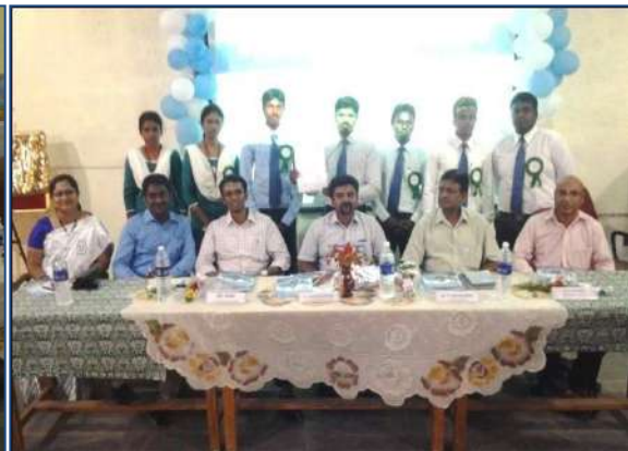
ADEONA – Elected Office bearers