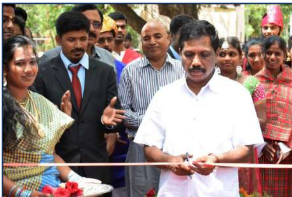
Handicraft Exhibition – Inauguration