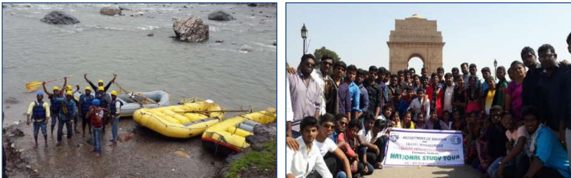
National Study Tour

As part of the curriculum, III UG, & II PG students of the Department of Tourism and Travel Management students undertook a study tour to Western part of India from 02.03.2016 to 09.03.2016 and covered major tourist spots in Goa, Mumbai, and Aurangabad. Students travelled in flight from Mumbai to Coimbatore.